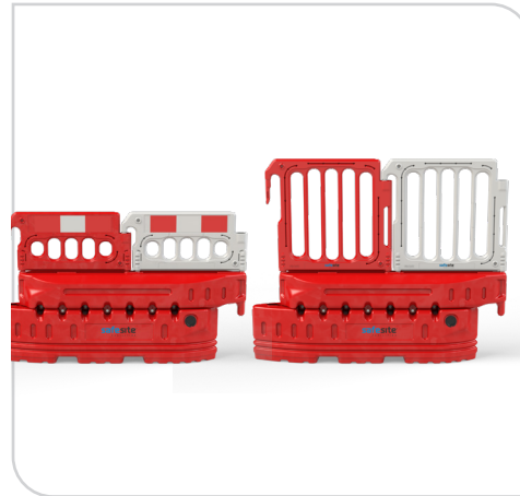
Compatible with Mini Topper Double Top