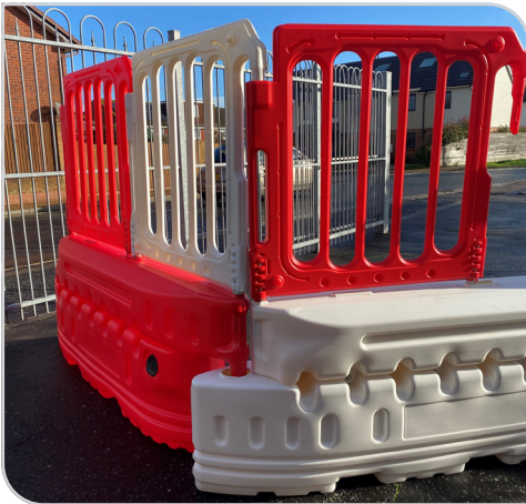
Connected at over 280° angular movement

With filling points on both sides, it allows a safe and rapid filling process, and a removable bung at the base facilitates easy emptying. This sturdy barricade is highly visible, providing effective guidance and control of vehicular movement while ensuring the safety of both pedestrians and drivers.